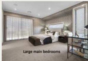
Large main bedrooms