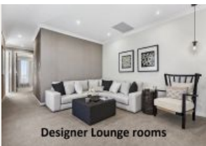
Designer Lounge rooms

Plans shown are only indicative of layout. Dimensions are approximate.